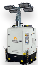
GAMMA Battery and hybrid