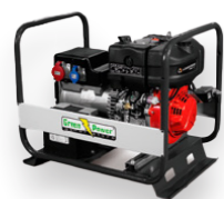
PORTABLE POWER 1.5 - 11 kVA

The Green Power Energy Storage System is the ideal product for who wants to have the maximum performance at zero emissions and zero noise. The storage allows to accumulate the energy of the public mains from renewable energy sources or from a simple generator, and then reuse it when needed. You can use this system at any time of day or night without worrying about refueling, maintenance, noise and atmospheric emissions. It is the ideal system to have energy on construction sites, in the city center as the main source or to manage peak loads.