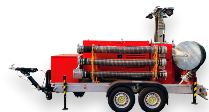
ALLIGATOR GLP Customizable on request

Self-priming motor pumps built on a frame with wheels and built-in tank, parking feet, electric start with battery and motor protection control unit. Ideal for drainage and any other more demanding application on construction sites and in the industrial and emergency sectors. The pumping of more abrasive fluids with high passage of solid bodies guaranteed by the robustness of the hydraulic system and the exclusive impeller, of the type with open blades and double curvature.