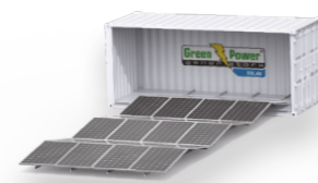
75.6kW Solar Panel & 80kW / 241kWh Storage