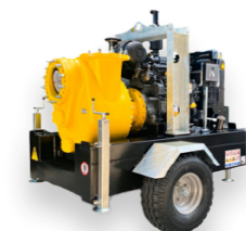
SELF PRIMING PUMPS 150 - 1350 mc/h