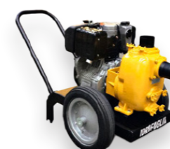
PORTABLE PUMPS 36 - 150 mc/h