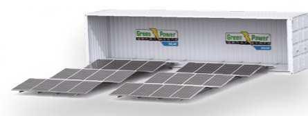
151kW Solar Panel & 120kW / 483kWh Storage