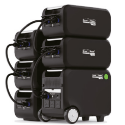
51.2V 40AH 2048WH