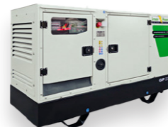
MOBILE POWER 9 - 2500 kVA