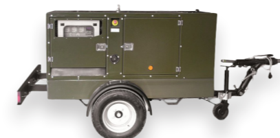
MILITARY GENERATORS Customizable on request