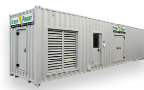
MEGA POWER 300 - 3500 kVA