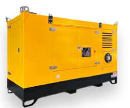
DRY PRIME PUMPS 150 - 2000 mc/h