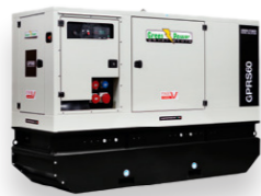
RENTAL POWER 5 - 1250 kVA